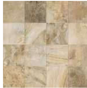
AK3P Calabria BI 20"x20" AK3S Calabria BI 12"x24" AK3L Calabria BI 13"x13" AK3V Calabria BI 6 1/2"x6 1/2"