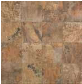
AK3M Calabria BR 20"x20" AK3Q Calabria BR 12"x24" AK3J Calabria BR 13"x13" AK3T Calabria BR 6 1/2"x6 1/2"

GLAZED PORCELAIN TILE | 3D PRINTING TECHNIQUE | MADE IN THE USA