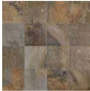
AK3N Calabria BL 20"x20" AK3R Calabria BL 12"x24" AK3K Calabria BL 13"x13" AK3U Calabria BL 6 1/2"x6 1/2"